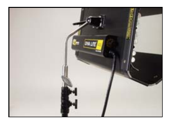
Mounted on a baby stand