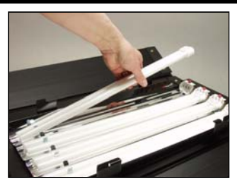
Pull lamp out of lamp clip.