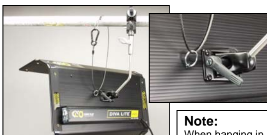
Mounted to pipe grid

When hanging in a studio, loop a safety cord through the strainrelief ring provided on the back of the fixture.